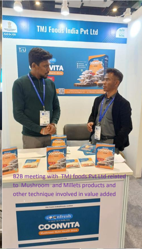
B2B meeting with TMJ foods Pvt Ltd related to Mushroom and Millets products and other technique involved in value added