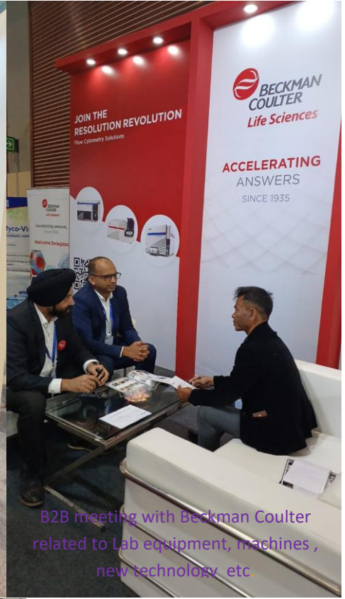
B2B meeting with Beckman Coulter related to Lab equipment, machines, new technology etc